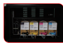
Ink storage You can store 2l high capacity ink