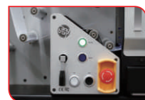
Safety switch panel Secure operating is possible with various safety device in certification standard.