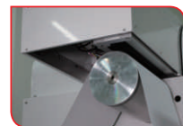
Ink-jet label printer Compact and fast ink-jet label printer can produce high-quality on-demand labels.