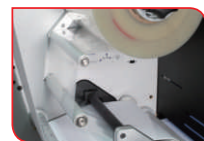
Lamination unit Laminating is possible on printed labels.