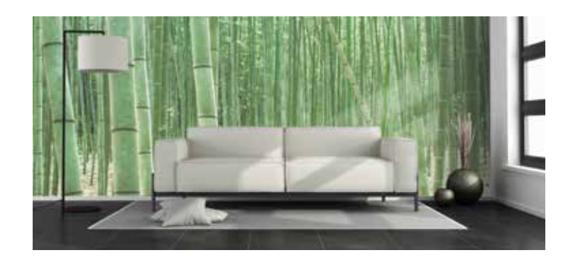
Photo wallpaper, on the other hand, looks best with a high-gloss finish that makes the colors pop. Give your customers realistic photo images that inspire.